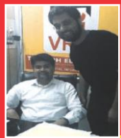
AYUSH SINHA IAS 2017