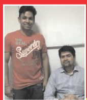
ANSHUL SINGH IAS 2017