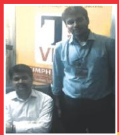
ADITYAVIKRAM HIRANI IAS 2017