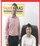
TEJAS N. PAWAR IAS 2017