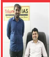
KOYA SREE HARSHA IAS 2017