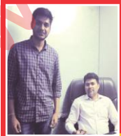
ABHISHEK KHANNA IAS 2017